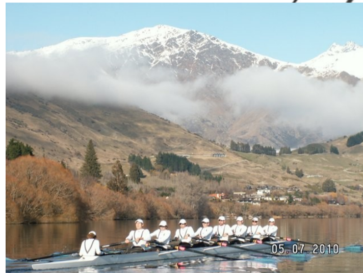
AUBC rowing for the Trans Tasman Trophy