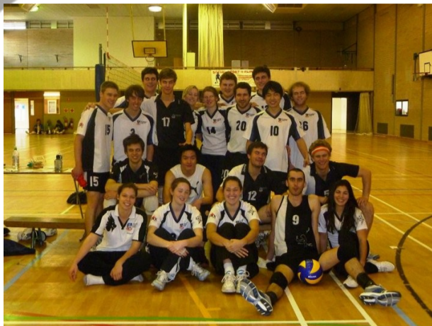
Adelaide University students at the SA Challenge

Congratulations and thank you to everyone for getting involved and we wish you all the best for the next big one - the Australian University Games in Perth later this year.