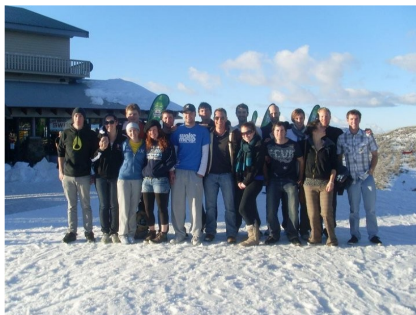
AUSKI trippers in Hotham